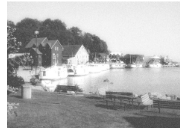
Port Stanley, Ontario

For directions to the hotel, go to www.theOEC.org .