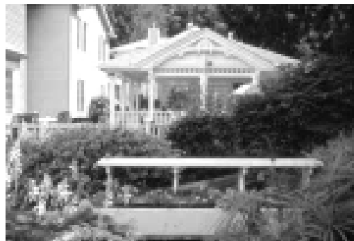
Kettle Creek Inn