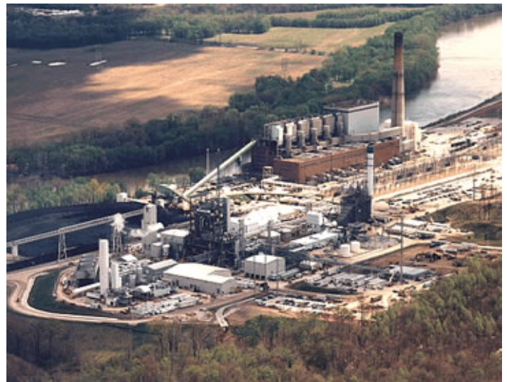
IGCC promotes the adoption of the coal power production methods that produce the most minimal environmental impact. (IGCC plant at Wabash, IN pictured above)

Third, we must assume that baseload power requirements are significant, and currently cannot be met completely with today's alternative or renewable fuels. Baseload power needs to be easily adjustable and transmittable. Right now, alternative and renewable sources cannot provide reliable baseload power on a large scale. This may, and most likely will change, but this reality has not yet arrived. Therefore,