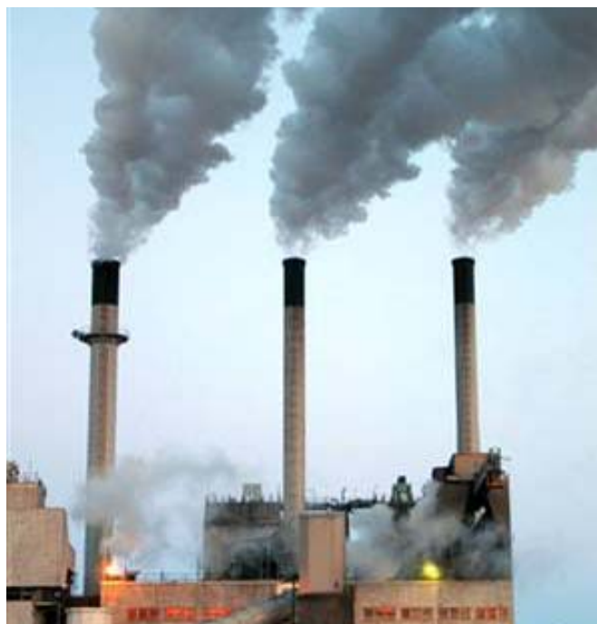
Traditional coal-burning power plants will become less profitable as the U.S. develops a cap-and-trade market for CO 2 emissions.

Ohio regulators cannot ignore this situation. Ohio is unusually reliant upon older, inefficient coal plants. A carbon