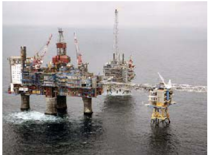
The Sleipner CCS project in Norway has been injecting CO 2 underground since 1996, and sequesters about one million metric tons of CO 2 each year.

CCS technology offers an opportunity to mitigate the harmful emissions of fossil fuels. But the facts on CCS are not as readily known as they should be. Here are several popular myths and important facts concerning CCS: