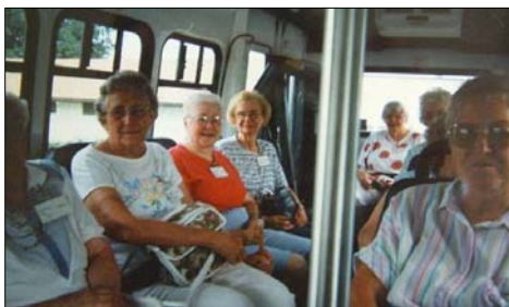
For many citizens, the bus is their only transportation option. By 2025, one in every five Americans will be over age 65—and wanting more transit.

SENATE BUDGET PROPOSAL: Defunds ODNR Scenic Rivers.