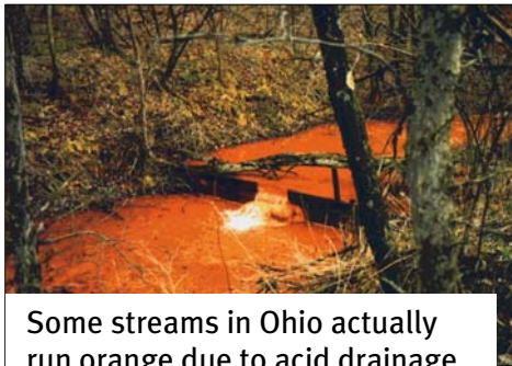
Some streams in Ohio actually run orange due to acid drainage from abandoned mine lands.

SENATE BUDGET PROPOSAL: Rejects CDD fee increase, but funds ODNR Soil & Water Conservation with liquor profits.