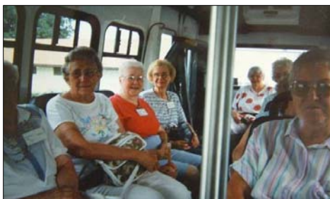
For many citizens, the bus is their only transportation option. By 2025, one in every five Americans will be over age 65—and wanting more transit.

4. PROTECT NATURE & PROMOTE ONE-TANK “STAY-CATIONS” SO MORE OHIOANS CAN ENJOY THE GREAT OUTDOORS RIGHT HERE IN OHIO SUPPORT Ohio’s Scenic Rivers, State Parks, State Nature Preserves, State Forests, State Wildlife Areas, and State Historic Sites and associated funding, as proposed in the Governor’s Executive Budget and approved by the Ohio House.