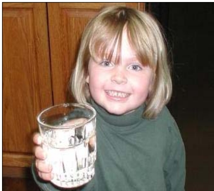
Public water systems oversight is up for grabs in the Budget Bill.