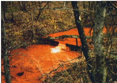
Some streams in Ohio actually run orange due to acid drainage from abandoned mine lands.

2. CONSERVE SOIL & WATER RESOURCES SUPPORT the full Waste Disposal Fee Increase on Mixed Solid Waste and Construction and Demolition debris as proposed in the Governor’s Executive Budget.